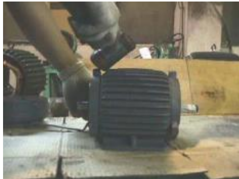
Figure 3 Tapping the end motor cover lightly