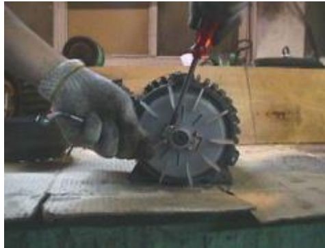
Figure 2 Loosening the cooling fan clamping screw