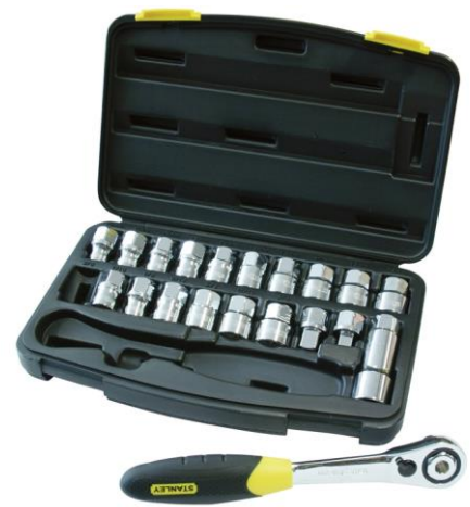
Figure 6 Required tools

Required tools: wrench set, screwdriver set