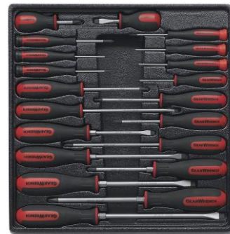
Figure 5 Required tools