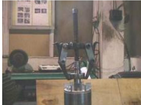
Figure 4 Using the bearing puller