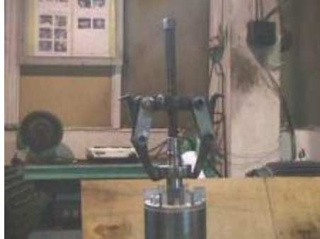
Figure 4 Using the bearing puller