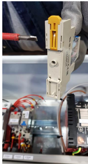
Figure 7 - "Clicking" part of the component

h) Please proceed installing the new replacement spare by following the steps indicated above in reverse order