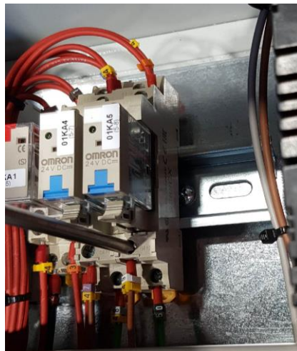
Figure 3 - Taking off the screws

d) Take off the screws with an insulated screwdriver