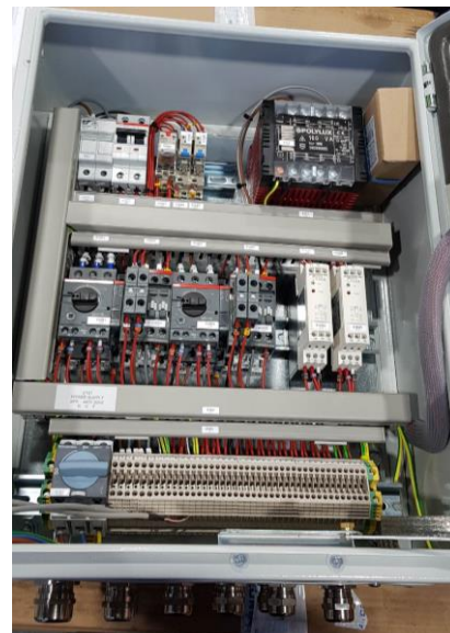
Figure 1 - Control panel (open)