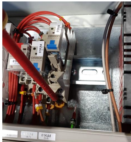
Figure 5 - Pressing on the bottom lid