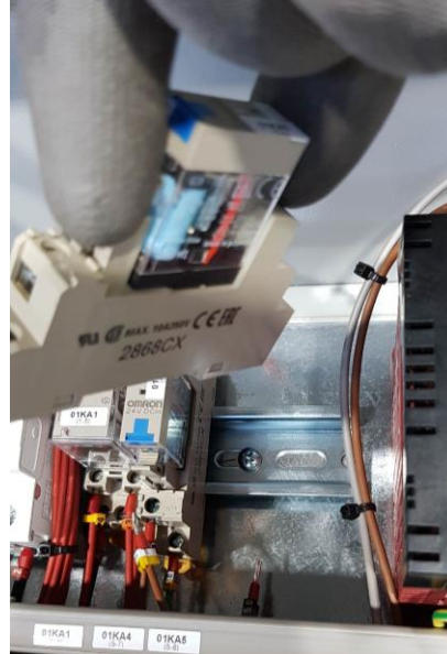
Figure 6 - Taking off the electric component

h) Please proceed installing the new replacement spare by following the steps indicated above in reverse order