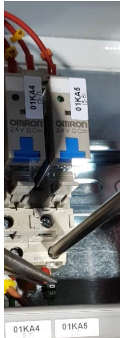
Figure 4 - Disconnecting the cables