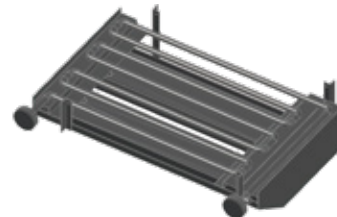
SEA WATER COOLING COILS