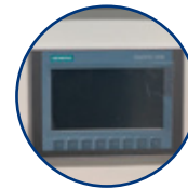
Control Panel without PLC