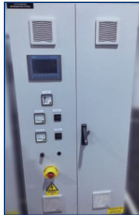
Control Panel with PLC