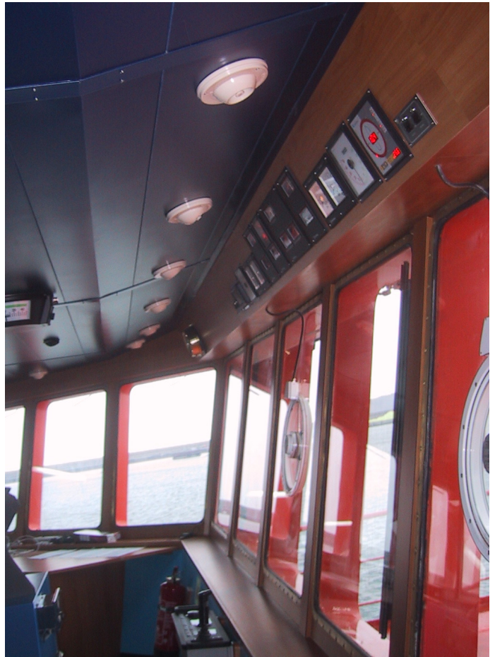
Defroster Systems in Wheelhouse

The air is blown towards the glazed area where the mist needs to be eliminated, using impulsion nozzles. There is a wide range of models and nozzle sizes for adaptation to the needs of each installation.